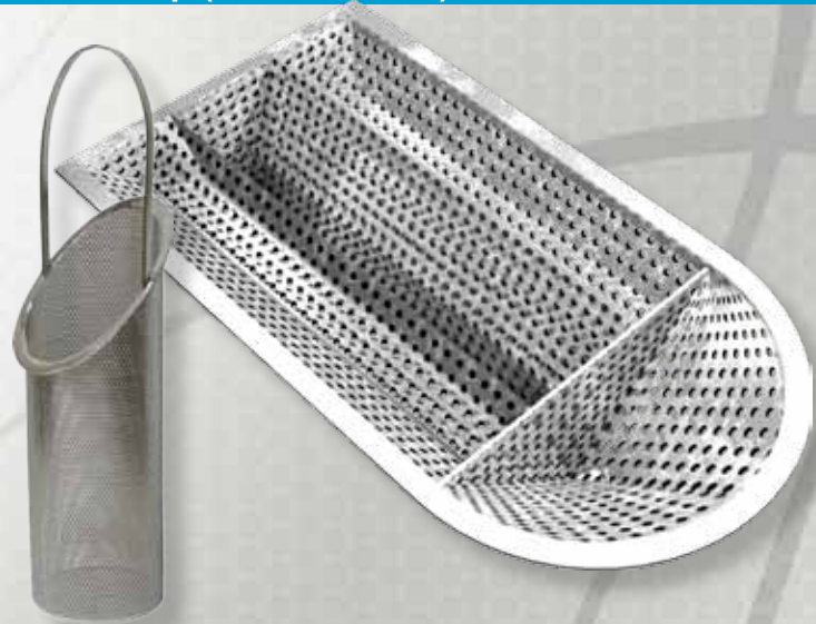
(Perforated basket 1/8" dia. holes on 3/16" centers)