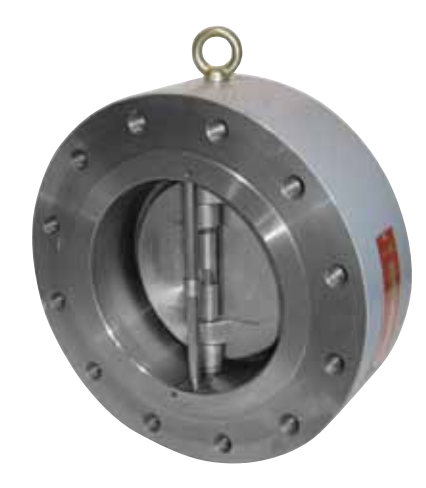
Manufactured to API 594 and tested to API 598

When you specify Sure Flow Check valves, you can be confident that not only are you making an investment in quality and reliability, but equally important, you know the service starts with the sale.